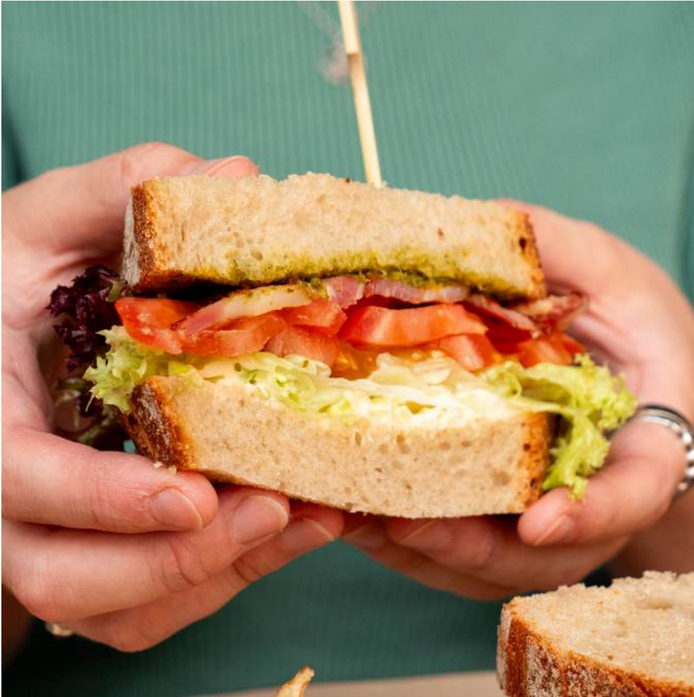
SANDWICHES ON SOURDOUGH