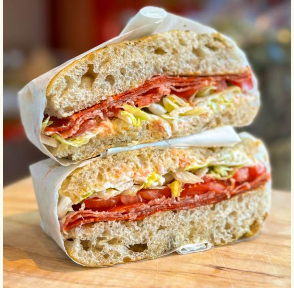
SANDWICHES ON FOCACCIA